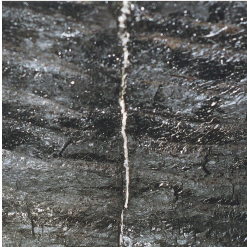
Photo 1 A hydraulic fracture propped with white sand in the roof coal at Dartbrook Coal Mine, NSW.

By placing sufficient proppant in a hydraulic fracture that extends a sufficient distance, a conductive channel is formed in the coal seam that acts as a conduit for the water and gas to travel along. The fracture faces expose a large area of the seam to the lower producing pressure, allowing the water and gas to drain directly into the propped fracture at an accelerated rate. Hydraulic fracture treatments are designed to place a propped conductive fracture in the coal seam that will efficiently stimulate production from the seam. The stimulation effect achieved depends both on the conductivity and size in length and height of the fracture and on the permeability and thickness of the coal seam. Effective stimulation of a low-permeability seam requires longer moderate conductivity hydraulic fractures, while stimulation of a high-permeability seam requires shorter high-conductivity fractures.